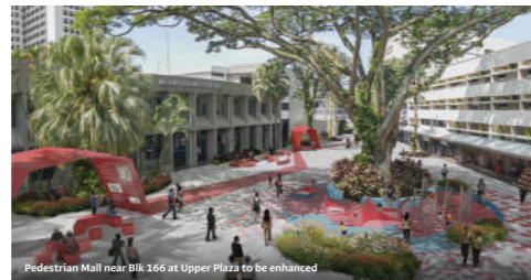
Pedestrian Mall near Blk 166 at Upper Plaza to be enhanced