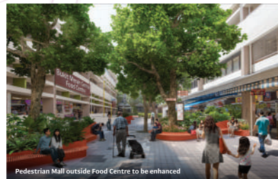
Pedestrian Mall outside Food Centre to be enhanced