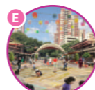
Redhill Square to be upgraded for community events

Community nodes will be introduced along Redhill Close and Henderson Road: