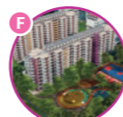
New fitness stations and pocket park