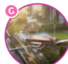
Newly renovated Delta Sport Centre