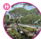
New rest area for cyclists along Henderson Road